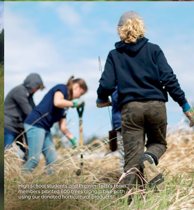
High school students and Premier Tech's team members planted 600 trees along a bike path using our donated horticultural products.

We contribute to preserving local species and maintaining ecological balance. By prioritizing local suppliers, we help bolster the regional economy and support local businesses. Beyond the fields, through donations and active community involvement, we ensure our global impact is deeply rooted in local values.