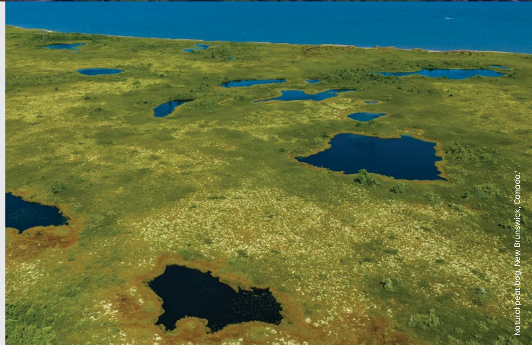
Natural peat bog, New Brunswick, Canada.

After harvest, we restore peatlands to reestablish their self-regulation mechanisms, thus reducing our carbon footprint. By promoting the return of native wildlife and flora, the peatlands recover their ecological functions, including their ability to accumulate peat and sequester carbon.