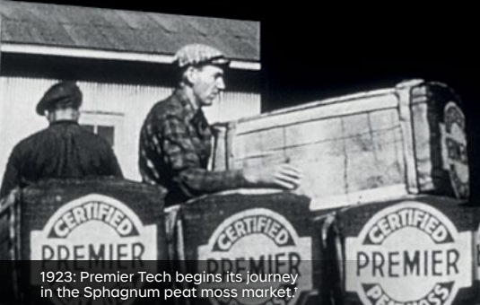
1923: Premier Tech begins its journey in the Sphagnum peat moss market.

We provide science-backed solutions to help you meet today's demands and future goals. Our commitment to Innovation, Research and Development (IR&D) ensures top performance, consistency, and long-term value.