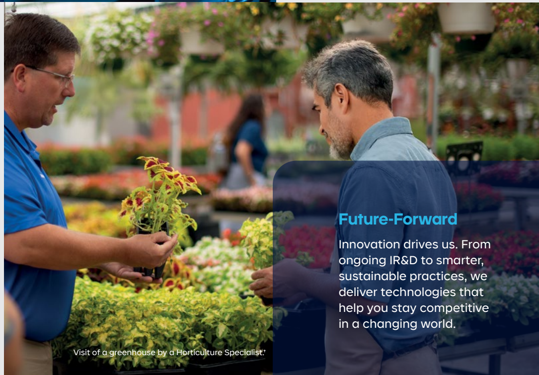
Visit of a greenhouse by a Horticulture Specialist.

Innovation drives us. From ongoing IR&D to smarter, sustainable practices, we deliver technologies that help you stay competitive in a changing world.