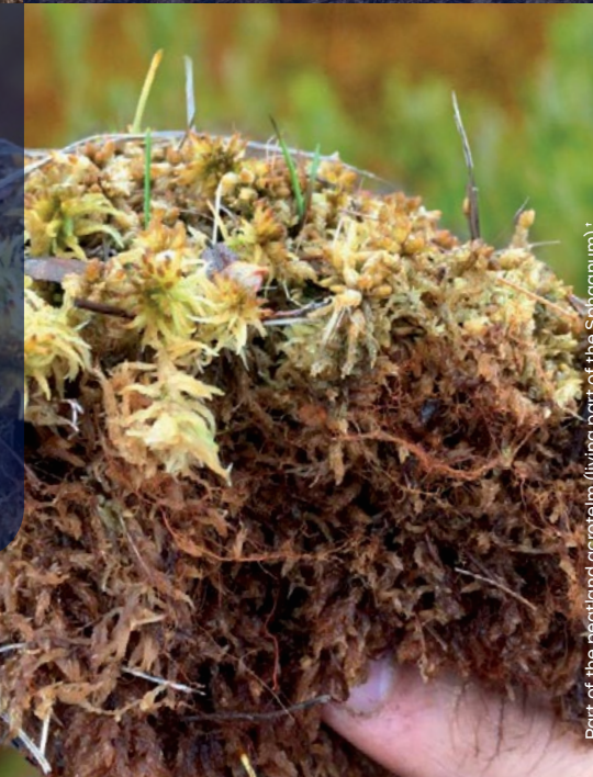
Part of the peatland arrotelm (living part of the Sphagnum).

By partnering with others to enhance the value of residual materials, we are exploring new ways for material recovery and upcycling, reinforcing our commitment to responsible production.