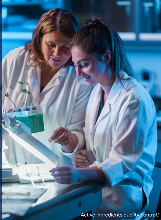
Active ingredients quality control.

With PRO-MIX® AGTIV®, our biostimulants and biocontrols come within your growing media to enhance plant resilience and performance. Get consistency, reliability, and superior plant development with every product.