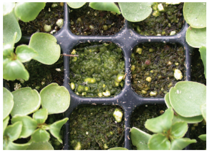
Figure 2. Keeping plugs and liners too wet can result in unwanted algae growth.

increases in root disease and rotting of cuttings. Media temperatures below 65F (18C) can slow germination and root development, increasing the likelihood of overwatering and root disease. Once seeds germinate and roots start forming on cuttings, reduce misting/ watering after seedling emergence and root formation on cuttings. If root disease is a common occurrence, use a better draining, peat-perlite growing medium amended with a biofungicide to help reduce root disease, such as PRO-MIX FPX BIO-FUNGICIDE.