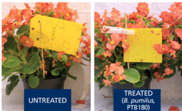
Closeup of fungus gnats counts on sticky cards. Untreated growing medium on the left and growing medium treated with Bacillus pumilus on the right demonstrating insect suppression.